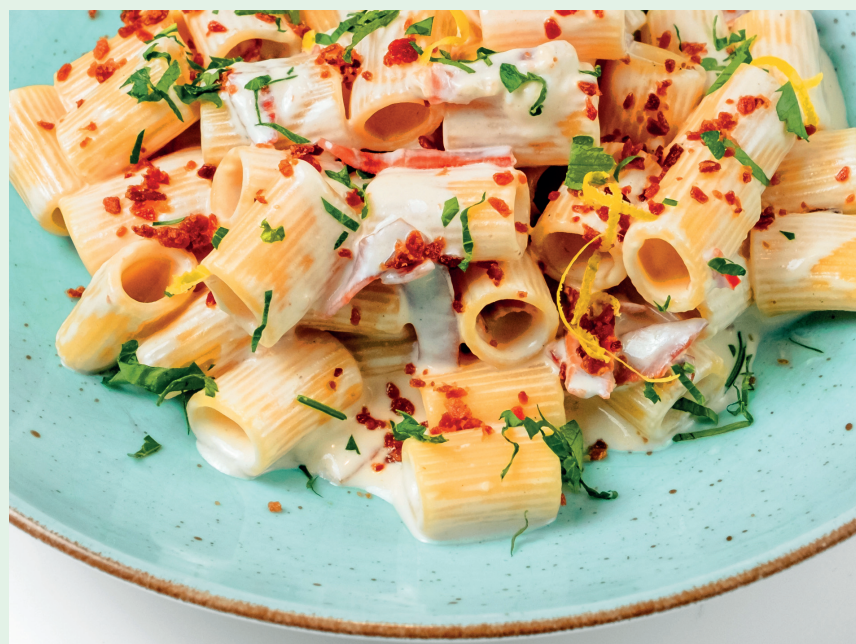
Rigatoni prosciutto crudo

063 Risotto con zucca e salsiccia 319,- NEW dýňové risotto, grilovaná salsiccia, parmazán a dýňový olej pumpkin risotto, grilled salsiccia, parmesan and pumpkin oil (7)