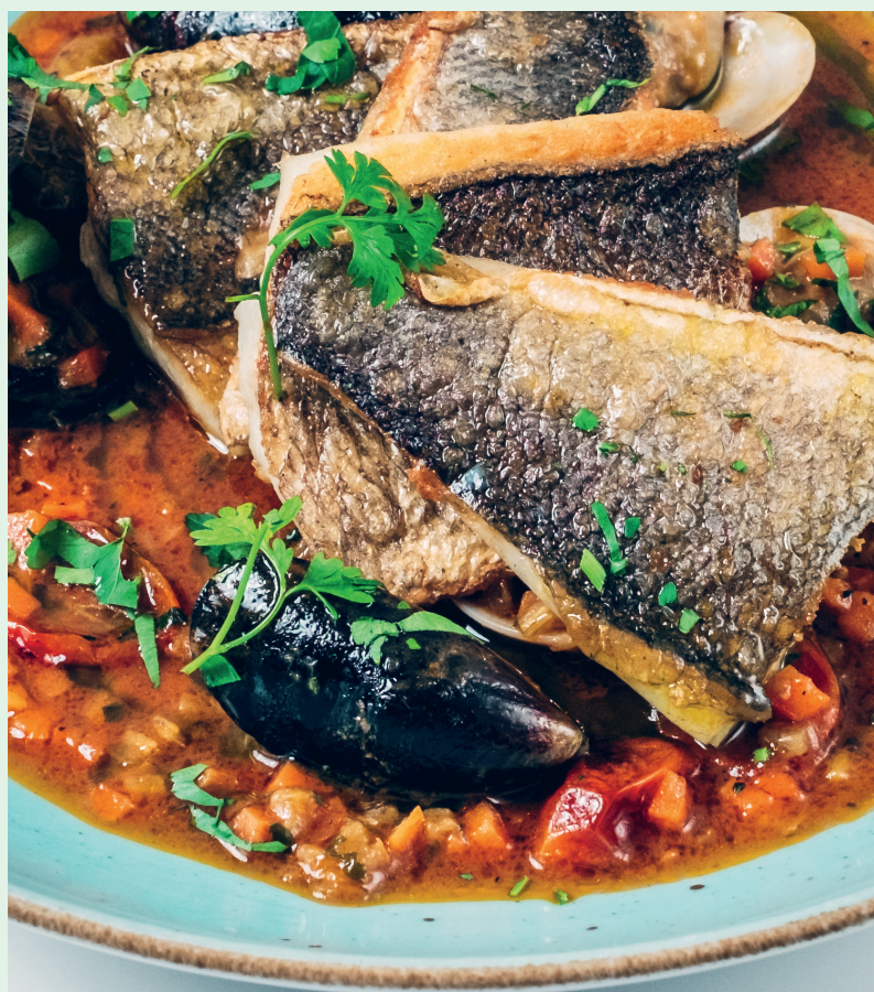
Filetto di orata in guazzetto