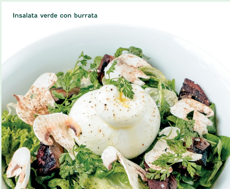
Insalata verde con burrata

ledový salát, hořčičný dresink, marinované kuřecí stripsy, pražená pancetta, červená cibule, cherry rajčata, ředkvičky, okurky a vařené vejce iceberg lettuce, mustard dressing, marinated chicken strips, roasted pancetta, red onion, cherry tomatoes, radishes, cucumber and boiled egg (3, 10)