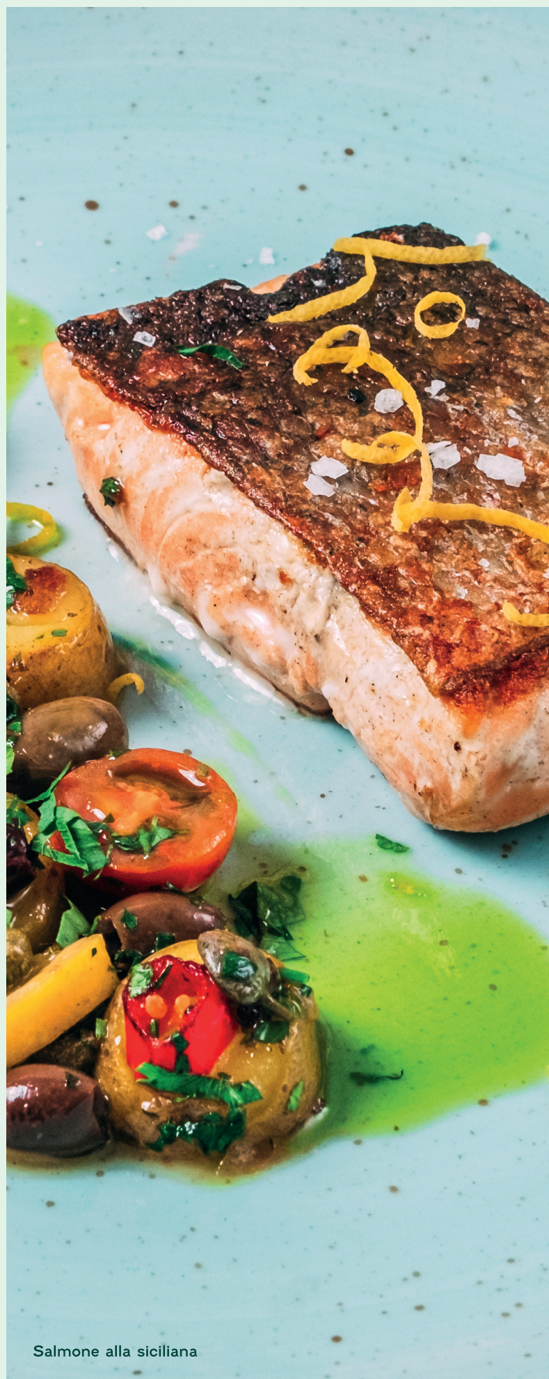
Salmone alla siciliana