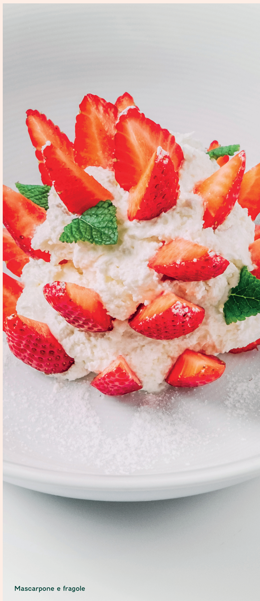
Mascarpone e fragole