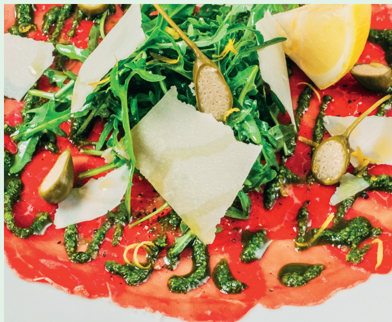
Carpaccio di scamone

sýr taleggio, gorgonzola, pecorino, grana padano, prosciutto, salám ventricina, pancetta, pečené nakládané papriky, olivy, chlebové chipsy taleggio cheese, gorgonzola, pecorino, grana padano, prosciutto, ventricina salami, pancetta, roasted peppers, olives, bread chips (1, 7)